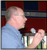
Agovia provides insight into SOA at the IASA Conference in Seattle in June.